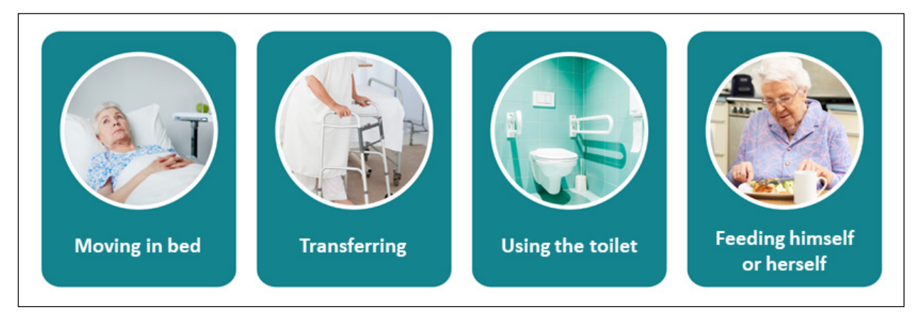
Figure 2 Activities of daily living comprising the RUG_III_ADL score

* There are 5 subcategories for Special Rehabilitation (ultra high, very high, high, medium and low).